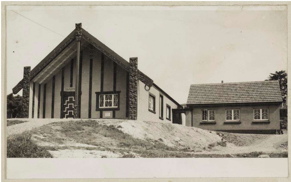
Otākou whare runaka c. 1946-c.1960. Ref no: P1990-015/49-360-002b.