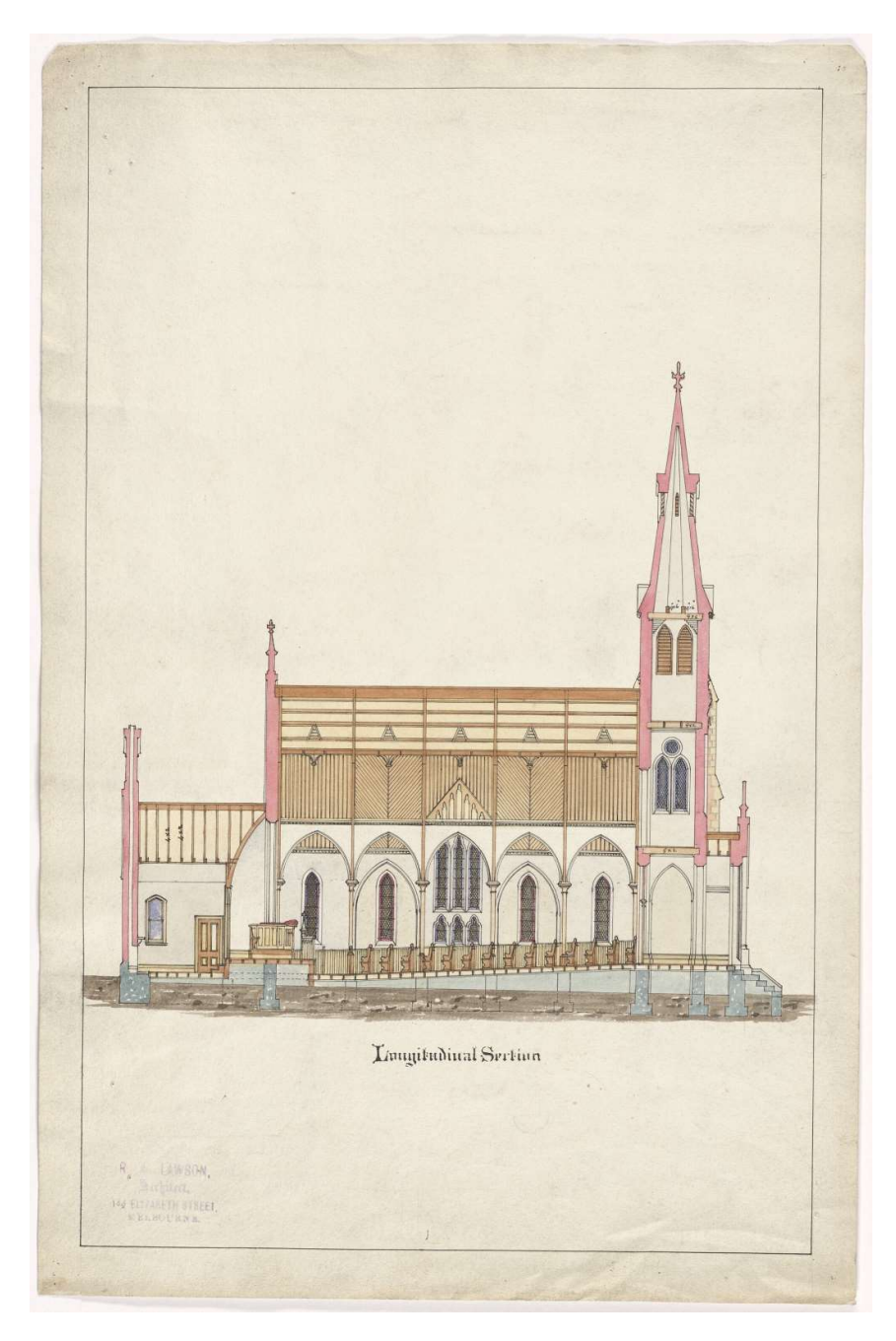
East Taieri Presbyterian Church, plan for church building, longitudinal section (Robert Arthur Lawson), c. 1870. MS-4275/015/002, Salmond Anderson Architects Records. Archives collection.

Hocken Collections/Te Uare Taoka o Hākena 90 Anzac Ave, PO Box 56, Dunedin 9054 Phone 03 479 8868 reference.hocken@otago.ac.nz https://www.otago.ac.nz/library/hocken/