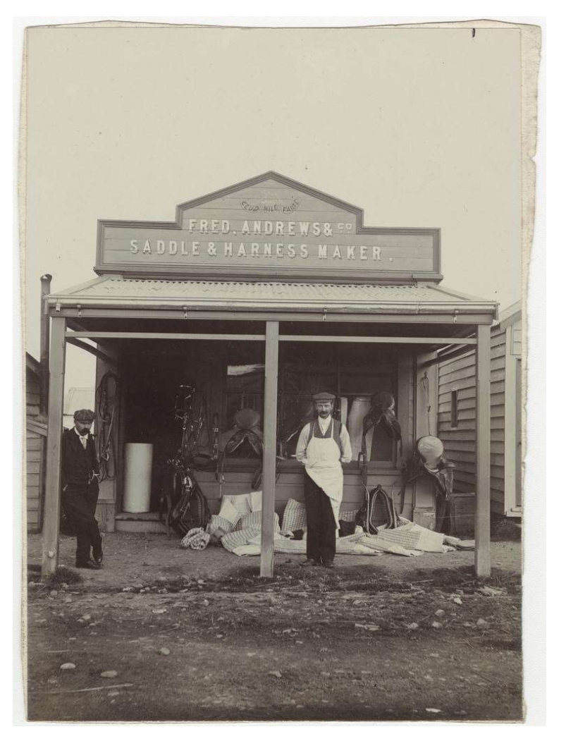
Fred Andrews & Co., Saddler and Harness Maker

University of Otago OTĀKOU WHAKAIHU WAKA