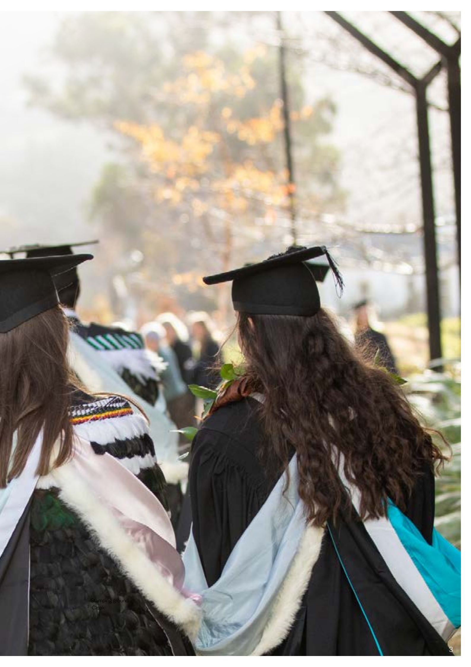
1 Stamping ground 2 Cloak