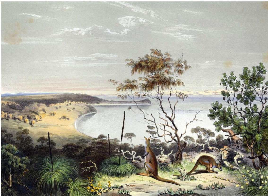
'Scene on the Coorong, near Lake Albert. With the Halmaturus Greyii , a new species of kangaroo.' South Australia Illustrated by George French Angas, London: Thomas McLean, 1847. Publications Collection.