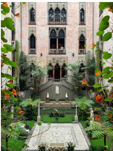
Isabella Gardner Museum