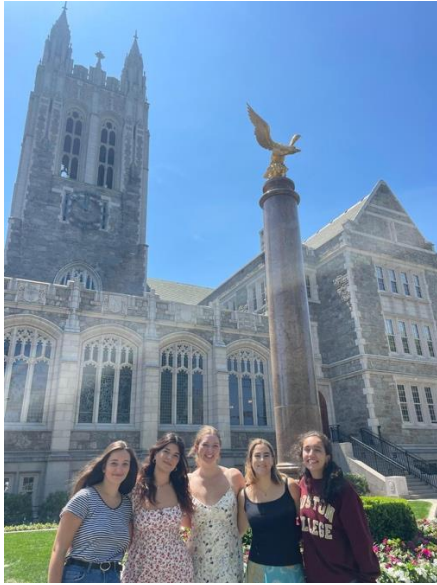
Last day of classes