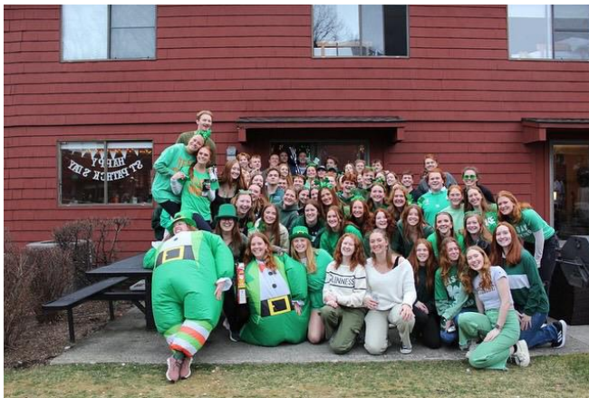
Ginger run before St Paddy's day