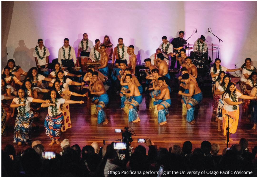
Otago Pacificana performing at the University of Otago Pacific Welcome