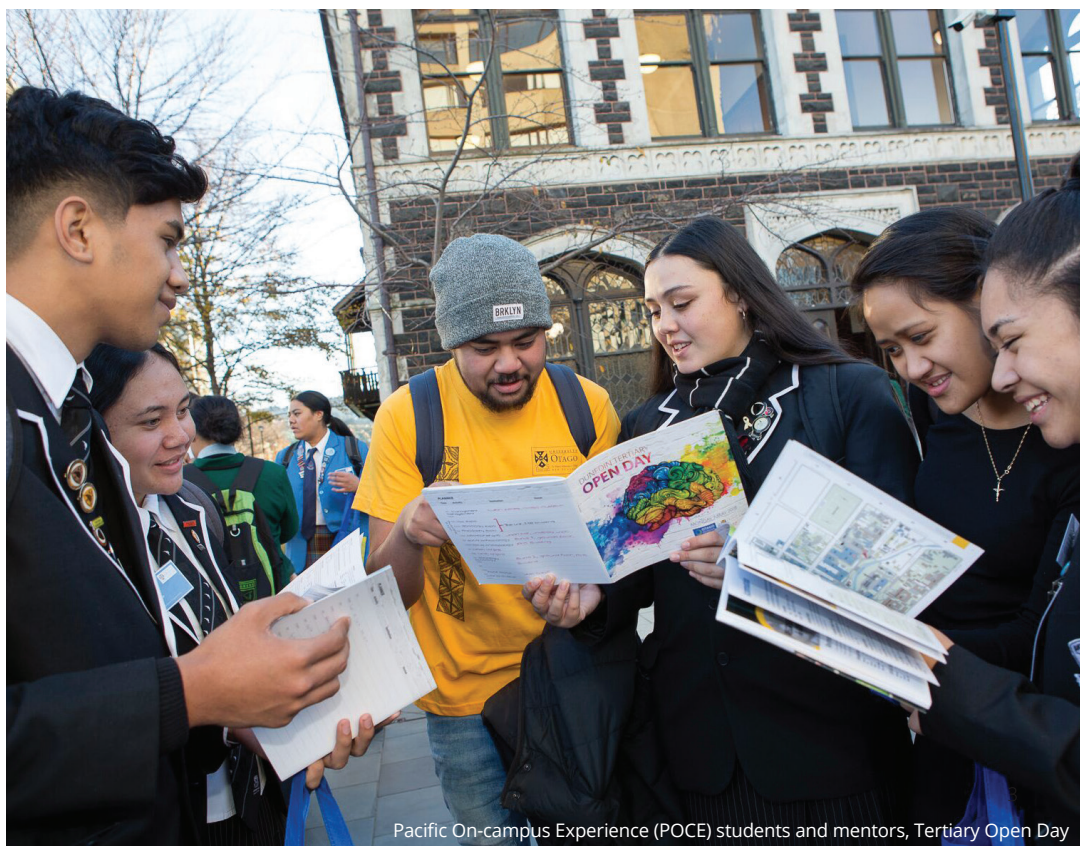
Pacific On-campus Experience (POCE) students and mentors, Tertiary Open Day