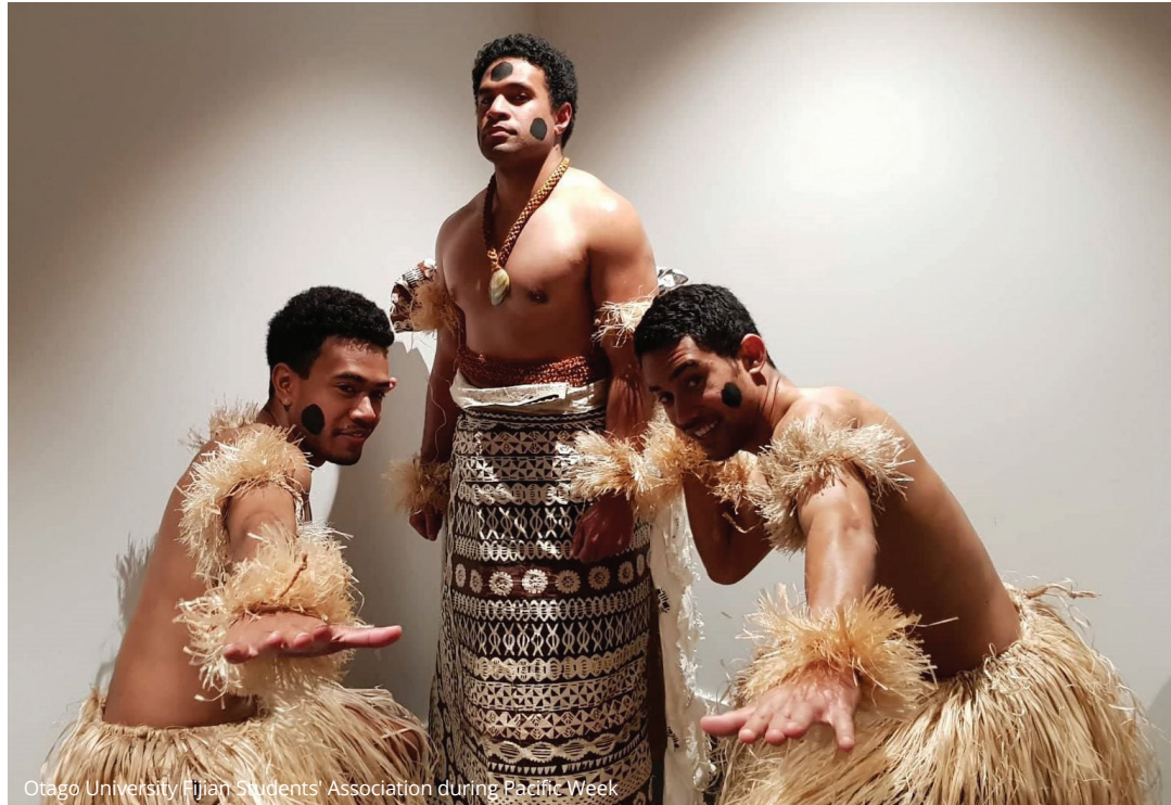
Otago University Fijian Students' Association during Pacific Week