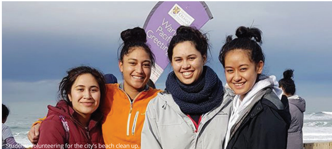
Students volunteering for the city's beach clean up.