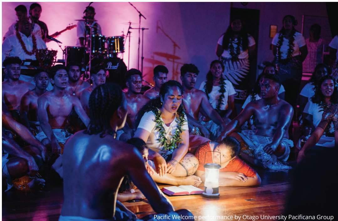
Pacific Welcome performance by Otago University Pacificana Group