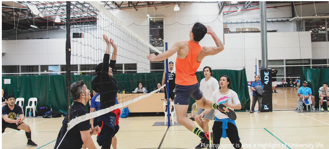
Playing sport is also a highlight of University life.