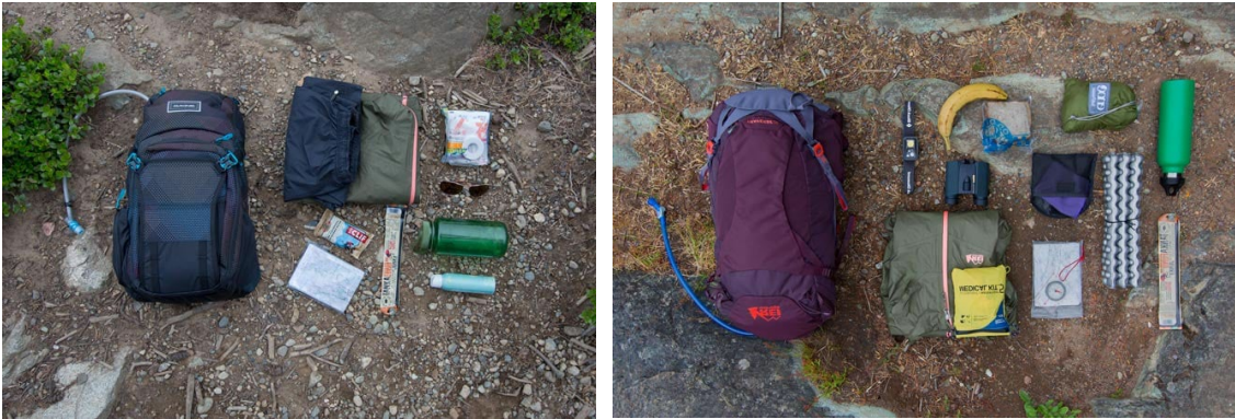
Left: 11-20 litre daypack and carrying capacity. Right: 21-35 litre daypack and carrying capacity.

Specifications: Bag size should be around 20-30 litres, and be able to carry all of your field equipment, lunch, and water (2L minimum).