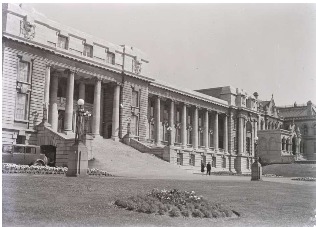
Glass plate negative of parliament buildings, Wellington (1930s), Dunedin Photographic Society Inc.: Records, MS-2094/045/026. Archives Collection.