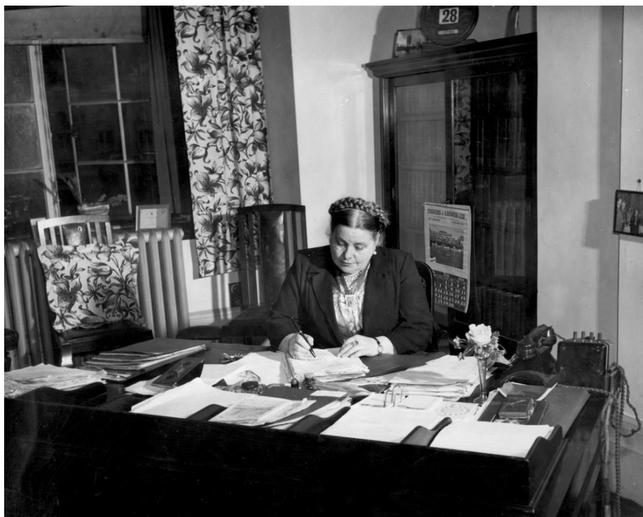
Photograph of Mabel Howard writing at her desk, 28 June 1949, from Photographs featuring Mabel Howard, c.1930-c.1970, Howard, Edwin John and Mabel papers. MS-0980/286/001. Archives Collection.