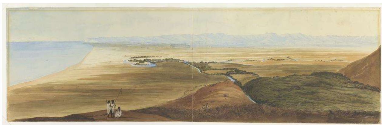
Fox, William, Sir (1812-1893). The Wairau Plain, 1845. Watercolour on 2 sheets of paper, each: 361 x 722mm; joined to form: 220 x 722mm, 12,900, Art Collection.