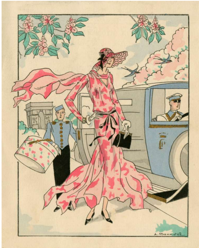
Invitation to an 'advance private showing of the modes for Spring and Summer 1930-31...' 1930-1931. D.I.C. New Zealand Limited: Ephemera, Eph-0015-HF-A-01.