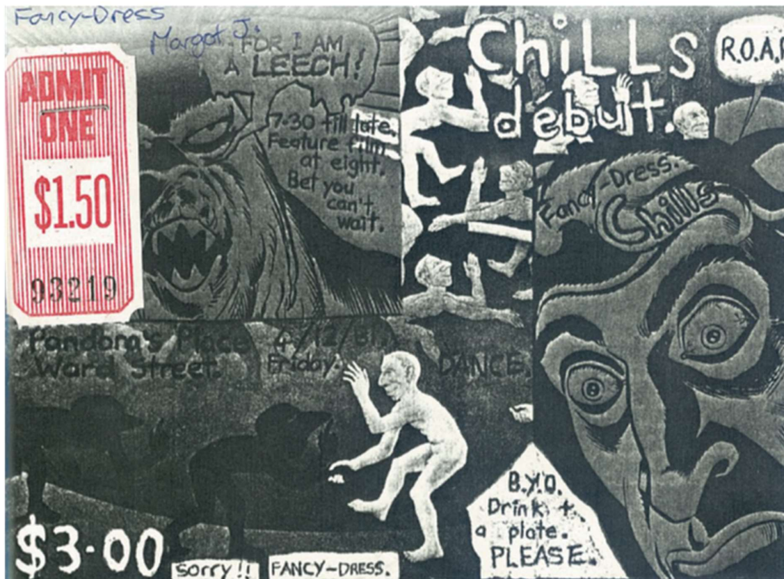
'Chills debut' concert ticket. c.1981. The Chills: Ephemera, Ephemera Collection Eph-0042-ML-A-01.

Hocken Collections/Te Uare Taoka o Hākena 90 Anzac Ave, PO Box 56, Dunedin 9054 Phone 03 479 8868 reference.hocken@otago.ac.nz https://www.otago.ac.nz/library/hocken/