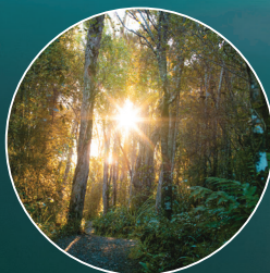
Port Chalmers, Aramoana, Orokonui Ecosanctuary