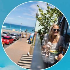
St Clair Esplanade 10 minutes' drive. Great surf spot with cafés and restaurants.

NO OTHER CITY in the country offers the same opportunities to get out and explore. Dunedin is surrounded by fantastic beaches, hills and harbour waters that offer opportunities for a range of activities, from surfing and kayaking to mountain biking and paddleboarding, most within a short commute from campus.