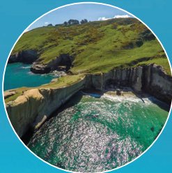
Tunnel Beach 20 minutes' drive. Spectacular rocky coastline with cliffs, rock arches and caves.