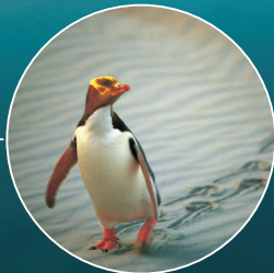
←← Otago Peninsula A wonderland of wildlife and scenery. At its end, Taiaroa Head (1 hour's drive) has the only mainland breeding colony of northern royal albatross in the world.