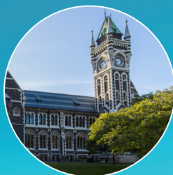
University of Otago