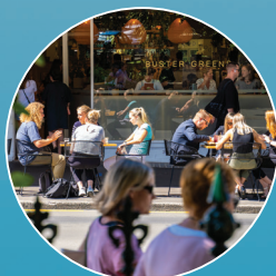
George Street Dunedin's main thoroughfare, with shops, cafés and restaurants.