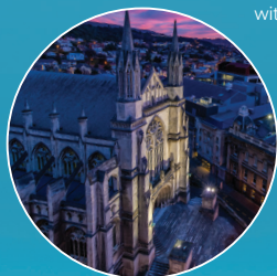
The Octagon 15 minutes' walk. City centre with cafés, bars, restaurants, shopping and entertainment.