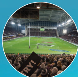
Forsyth Barr Stadium 5 minutes' walk. New Zealand's only covered sports arena.