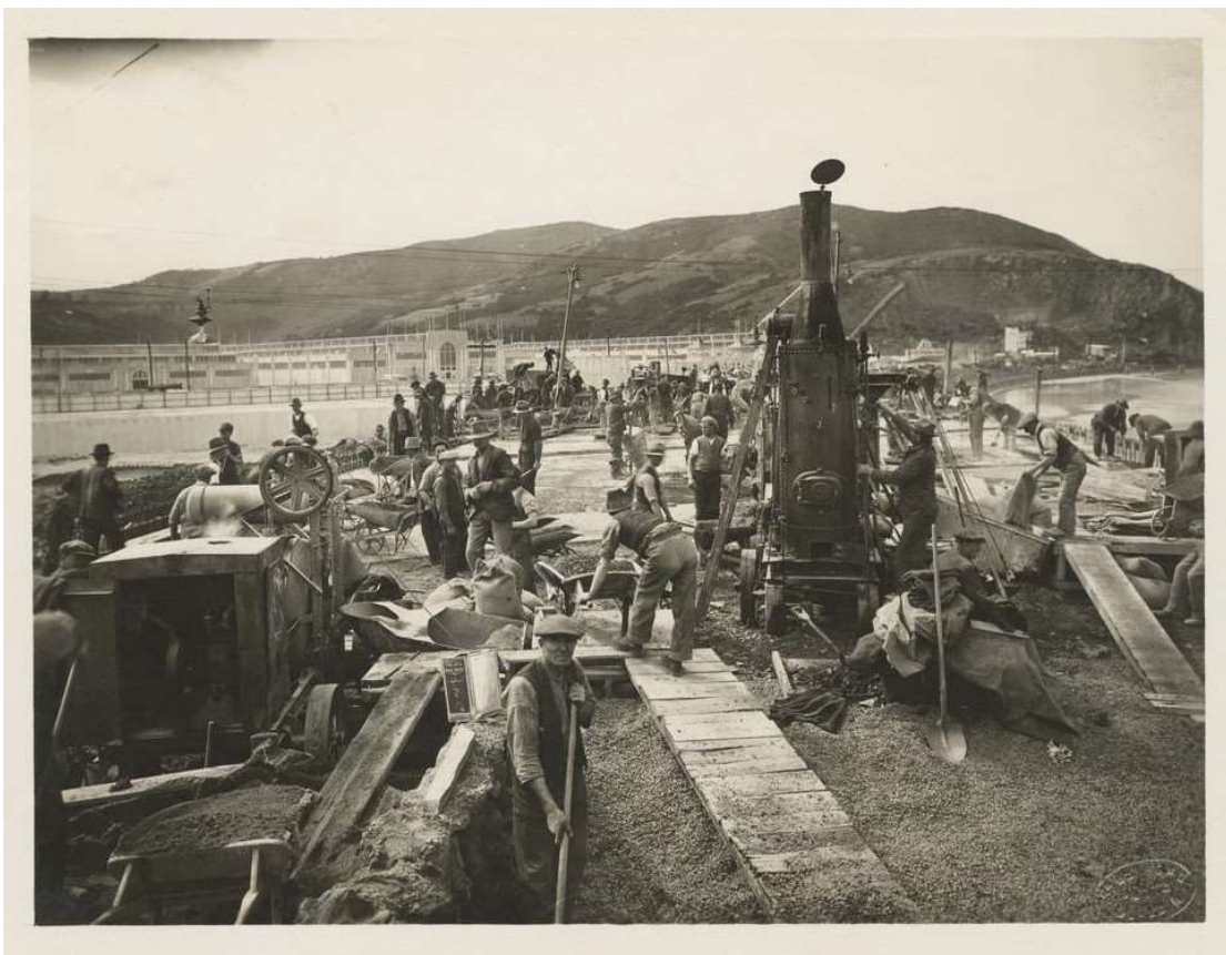
Building bridge over Water of Leith, Anzac Avenue, Dunedin, 1925.